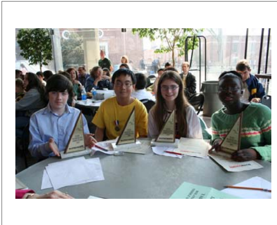
Middle schoolers competitive state-wide

It may be surprising, but applying for Middle School programs in Baltimore City is much like applying for college: you must complete and meet an application deadline.