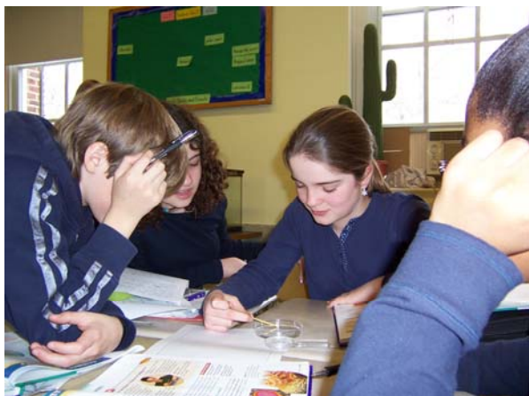
Teamwork is a vital ingredient in the Ingenuity Classroom!

Always have a back-up plan: APPLY TO MORE THAN ONE PROGRAM! Give yourself plenty of time to fill out applications and gather the required information and recommendations. Make a list of the places you are applying to and then write the application deadline next to each entry. Better yet, put it on your calendar to limit your chances of missing it. Read through applications carefully. Most applications will