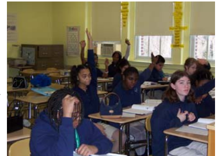
It never hurts to ask for help!