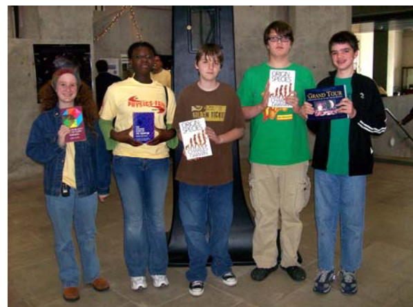
Ingenuity students at the Johns Hopkins University Physics Day

Once you have all this information, select programs that will be a good match for your child's abilities and interests. Not all programs or schools will be the best place for your child. Find out what the admissions process for each program/school involves and when applications are due.